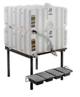
80/80 #1032700N95401 36"L x 36"W x 65"H