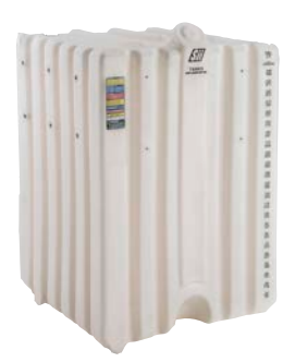
180 gallon tank.