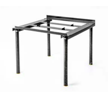
Durable powder-coated steel stands in a variety of leg heights