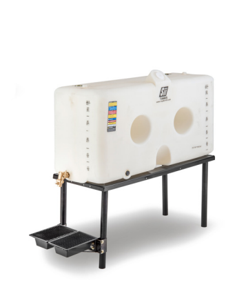
120 Slimtainer Gravity Feed System with Drip Tray #1035500N95402

11. Fill each tank. Be sure to double check each fitting for leaks. Snyder is not responsible for fluid loss or clean-up costs.