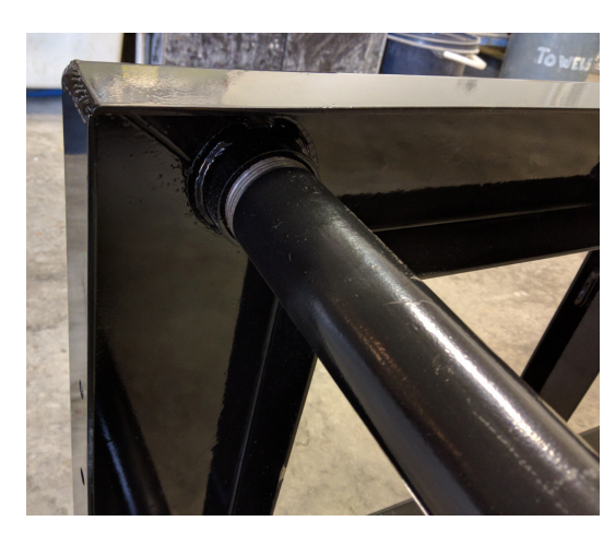
NOTE: If you ordered a system with a containment tank rather than a drip tray kit, skip ahead to step 4B.

2. Attached drip tray holder brackets to drip tray frame on each side using the [4] 3/8" x 1" carriage bolts, washers and nuts. Hand tighten for now so that you have some play to get them on the stand legs.