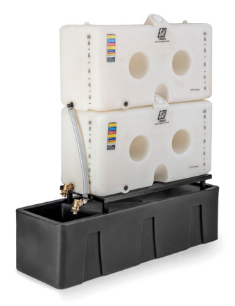
120/120 Slimtainer Gravity Feed System with Containment #1035700N95403