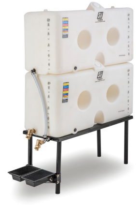
120/120 Slimtainer Gravity Feed System with Drip Tray #1035700N95402