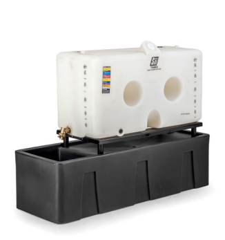
120 Slimtainer Gravity Feed System with Containment #1035500N95403