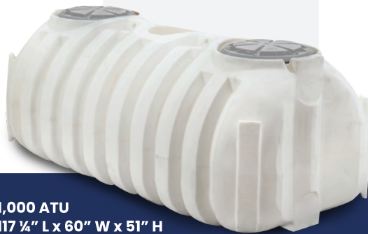
1,000 ATU 117 1/4" L x 60" W x 51" H

1,000 GAL 3 or less Bedrooms (up to 2501 sq. ft.)