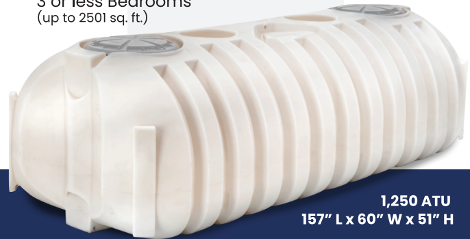
1,250 ATU 157" L x 60" W x 51" H